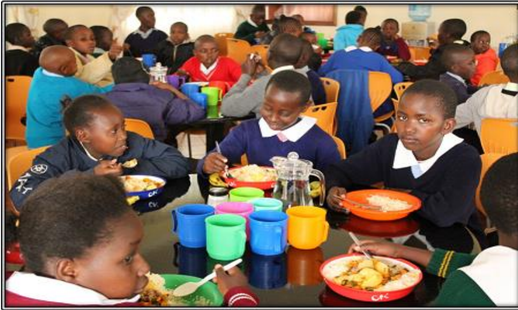
Pupils and parents/guardians having their lunch during academic day I